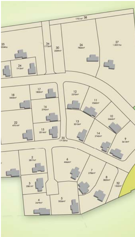
Quarry View Application Plan